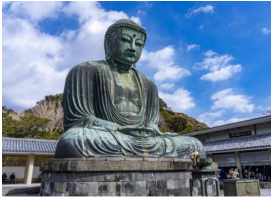
The Great Buddha of Kamakura