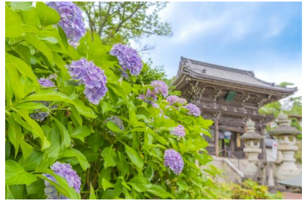
The hydrangeas of Kamakura