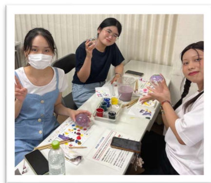
Furin (wind chime) Workshop in Edogawa