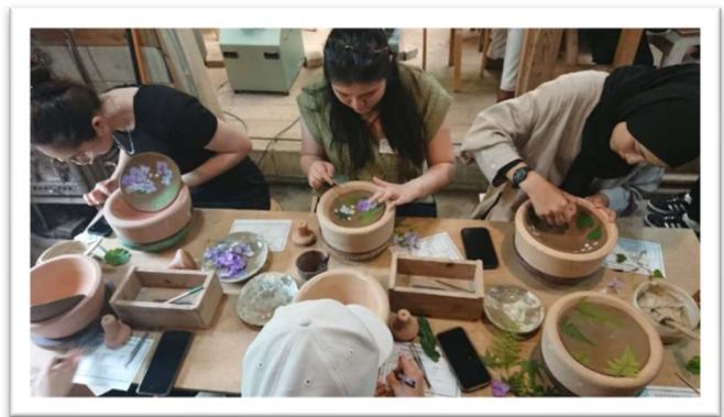
Visiting Tsuruoka Hachimangu (Shirine) and making pottery in Kamakura