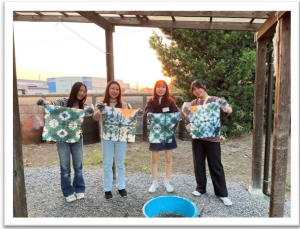
Indigo Dyeing "Aizome" experience in Kawagoe