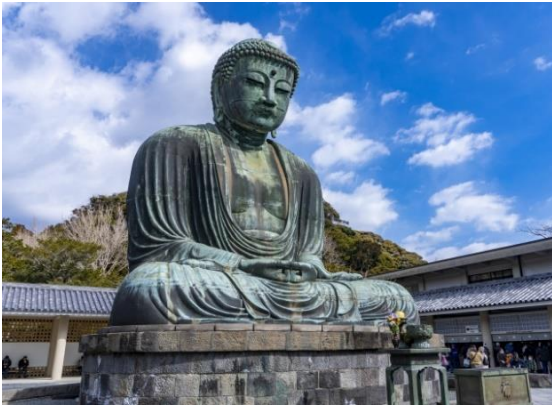
the Great Buddha of Kamakura"

The Sagamihara Campus enjoys excellent access to popular tourist destinations such as Yokohama and Kamakura. Students, both Japanese and international, can easily visit historical landmarks and beautiful coastlines during weekends or holidays, providing a refreshing break amidst their academic pursuits.