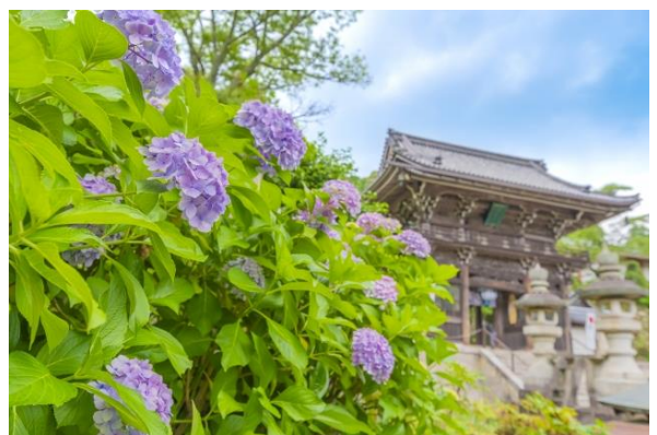
The hydrangeas of Kamakura