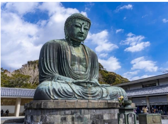
the Great Buddha of Kamakura"

The Sagamihara Campus enjoys excellent access to popular tourist destinations such as Yokohama and Kamakura. Students, both Japanese and international, can easily visit historical landmarks and beautiful coastlines during weekends or holidays, providing a refreshing break amidst their academic pursuits.