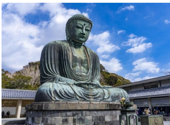
the Great Buddha of Kamakura

The Sagamihara Campus enjoys excellent access to popular tourist destinations such as Yokohama and Kamakura. Students, both Japanese and international, can easily visit historical landmarks and beautiful coastlines during weekends or holidays, providing a refreshing break amidst their academic pursuits.