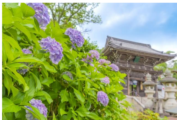
The hydrangeas of Kamakura